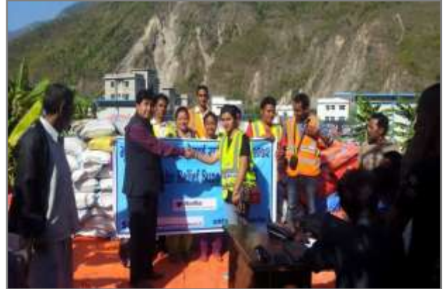
Rasuwa CA member showing his gratitude to SAHAS team before the distribution of relief materials in Rasuwa