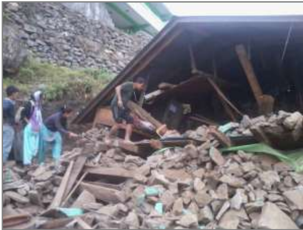
Local people trying to take their stuffs from the rubble