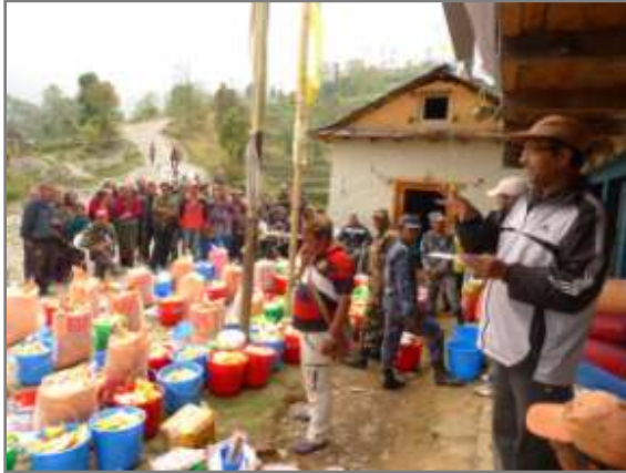
SAHAS Project Coordinator briefing the distribution of relief materials and affected households in Okhaldhuna district

kg beaten rice, 42182 kg pulses, 3 kg soybeans, 22550 litres oil, 21423 kg salt, 152 packets of baby food (super flour, cerelac and lactogen), 1092 packets of dalmot and 1000 kg of sugar were distributed to affected families.