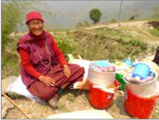
Smile with a relief materials