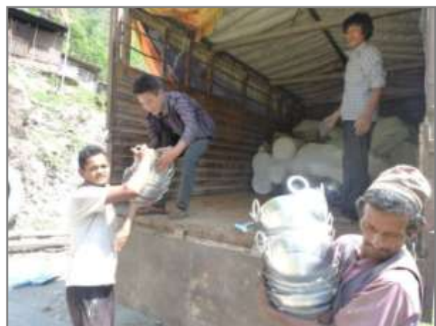
Unloading relief materials( cooking utensils) in the field