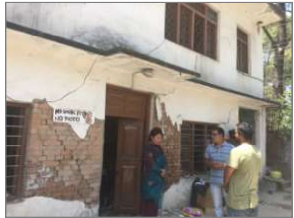
Observing Damage building of Surya Children Welfare Service Center Nepal by SAHAS Executive Director