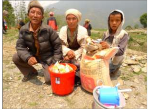
Families with a relief materials