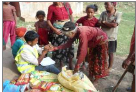
SAHAS Staffs putting ink mark on fingernails of people after relief distribution in Gorkha district