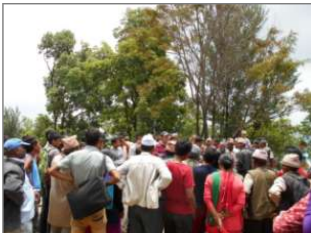
Coordination meeting at Phoolkharka, Dhading for relief distribution.