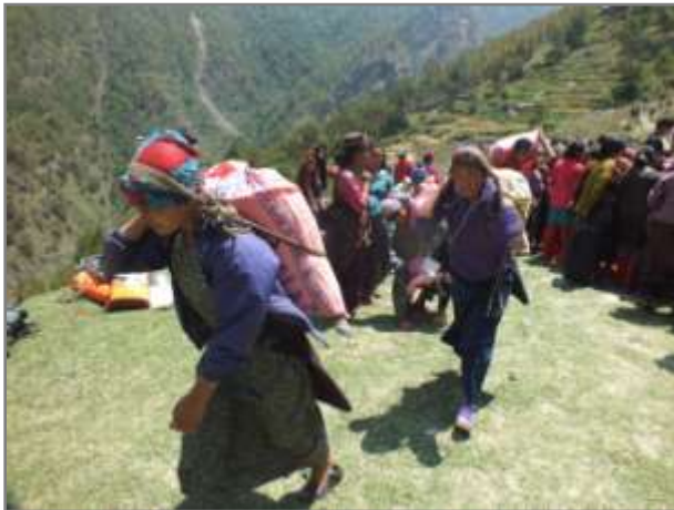
Victim family taking their supported relief items