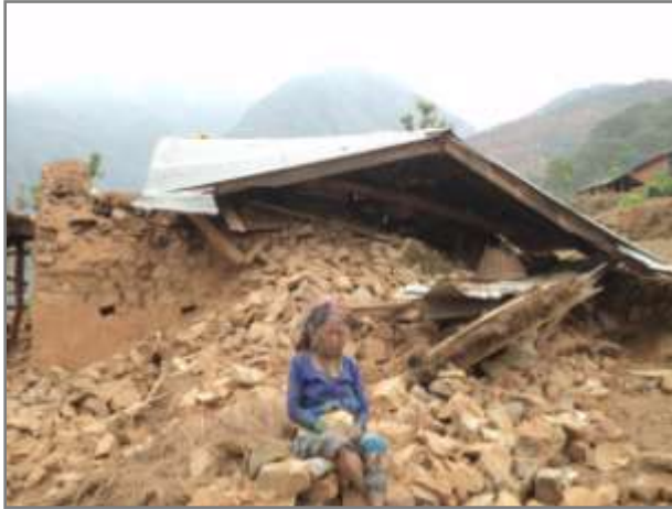
Old woman in deep grief sitting in front of her completely destroyed house in Okhaldhunga