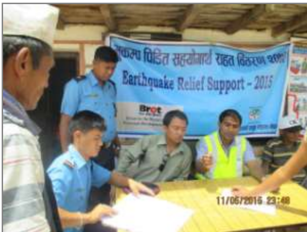
SAHAS staffs, Nepal police & government officials finalizing the affected families checklist for distribution of relief materials in Udayapur