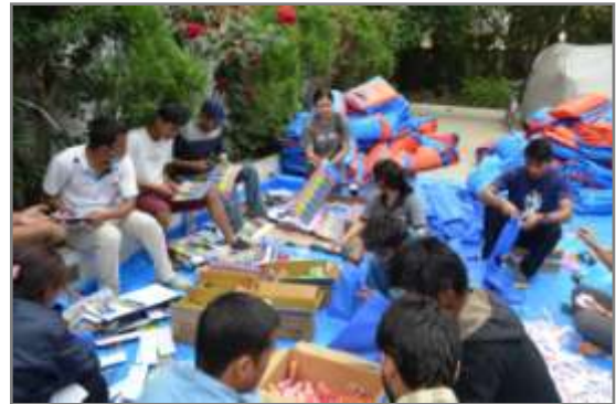
SAHAS staffs and volunteers packing the hygiene kits

Access to safe water has been jeopardized and drinking water has been contaminated. In order to minimise the risk of disease outbreaks and spreading of communicable diseases some hygiene kits were also distributed immediately. A total of 3560 chlorinated tablets, 19107 soaps, 550 toothbrush, 550 toothpaste, 550 ORS and 550 medical tapes were distributed.