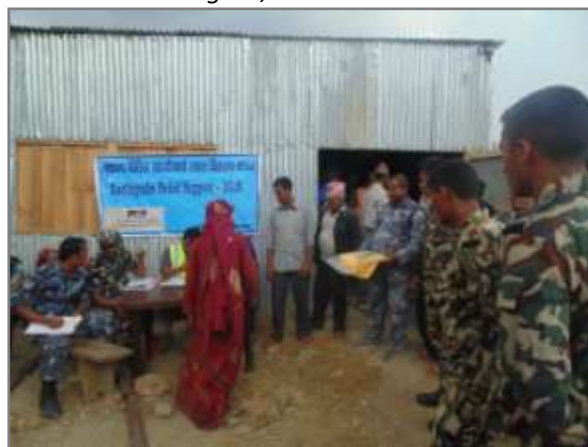
Nepal army and police helping in distribution of relief materials