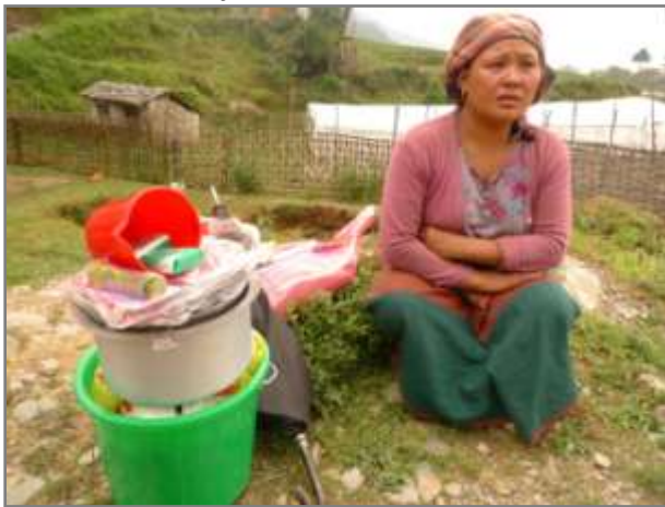
Woman with a relief materials