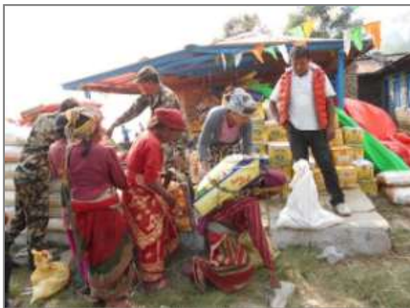
Women carrying sacks of rice (Phoolkharka, Dhading).