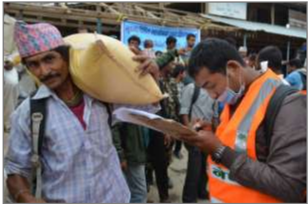
SAHAS staffs checking the list and entering the name of the relief supported families