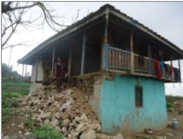
Damaged house in Udayapur