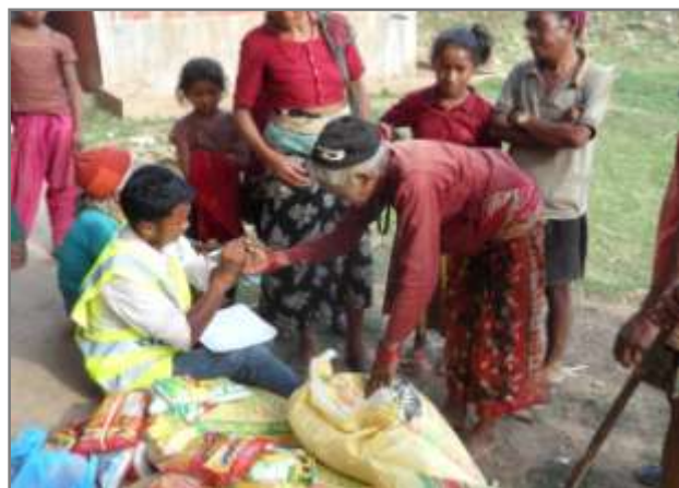
Staffs putting ink mark on fingernails of people after relief distribution (Bhulmichowk, Gorkha)