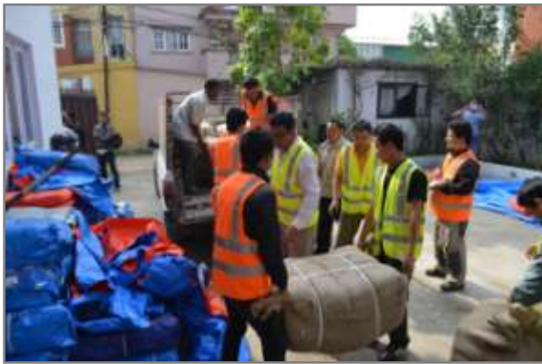
Rasuwa youths volunteering in SAHAS relief operation