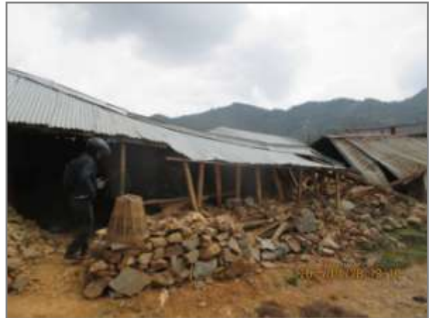
SAHAS staff assessing the status of quake damage