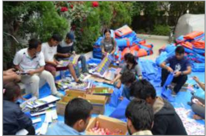
SAHAS staffs and volunteers packing the hygiene kits