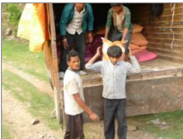
Unloading relief materials(food items) in the field