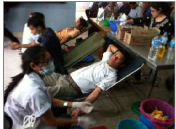
SAHAS staffs participating in blood donation program