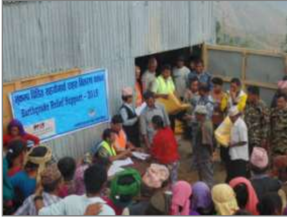
Distribution of relief materials to affected families