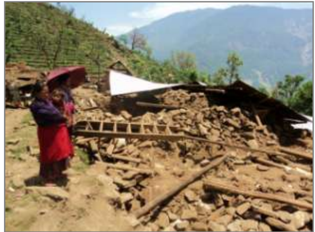
Photo: Thulogau VDC of Rasuwa change into rubble after 25 th April earthquake

Among 18 working districts of SAHAS Nepal, 6 districts namely Gorkha, Dhading, Rasuwa, Lalitpur, Okhaldhunga, and Makwanpur are heavily affected. More than 80 per cent of the houses in SAHAS working areas of Rasuwa, Gorkha, Dhading and Okhaldhunga have been destroyed or are in dilapidated state. Earthquake followed by rain has triggered landslide and wrecked more houses in the working areas.