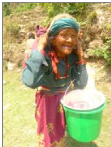
Relief materials bringing the smile in Old woman