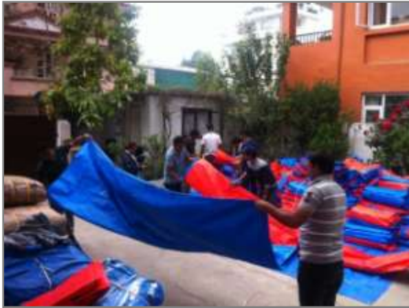
Packing tarpaulin in SAHAS central office for dispatch