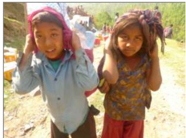
Children carrying relief materials