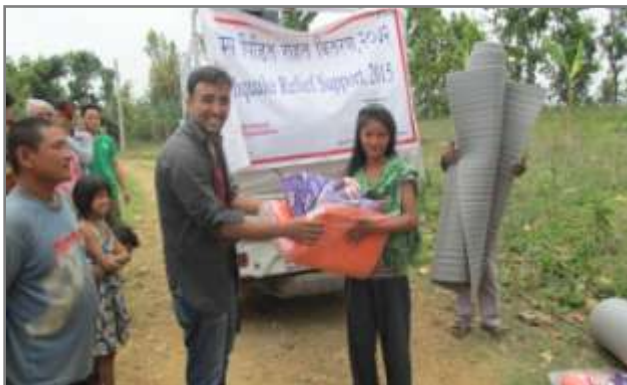
Relief support distribution in Makwanpur