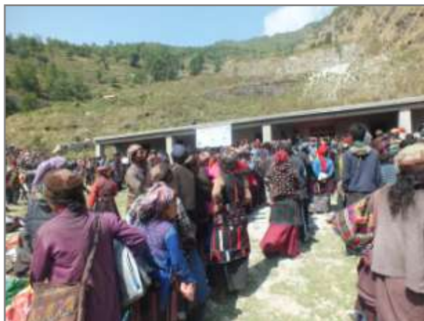
Affected families in a queue to receive relief materials, Rasuwa.