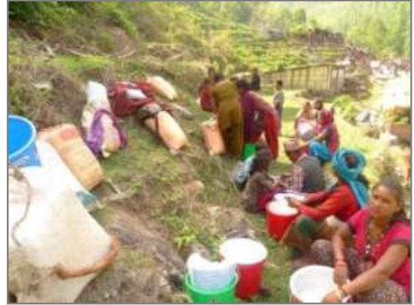
Affected families with their supported relief materials