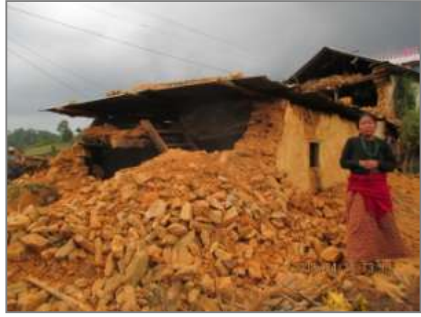
Woman standing in front of destroyed house in Lalitpur