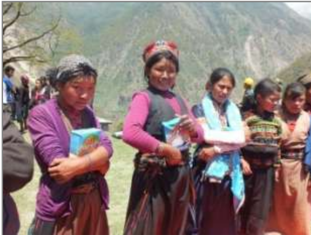
Mothers were supported with baby food for their children