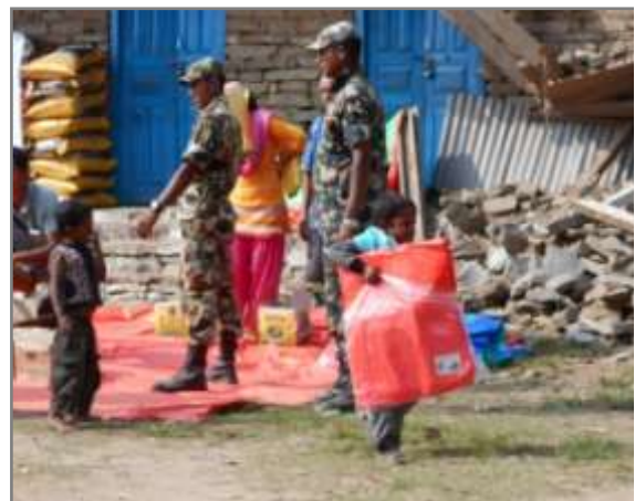
Small boy taking the tarpaulin supported by SAHAS in Dhading district