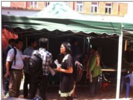
SAHAS staffs and volunteers testing the health before the blood donation

Blood donations are a huge part of emergency preparedness. However, emergency preparedness is not enough in Nepal and keeping an adequate supply of blood became a challenge. Immediately after the earthquake disaster, SAHAS has organized a blood donation program. SAHAS staffs including national and international volunteers participated in blood donation program.