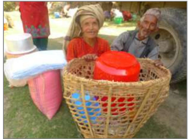
Smile and happiness after getting relief materials