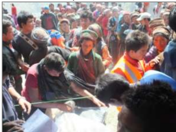
SAHAS staffs checking the affected household list