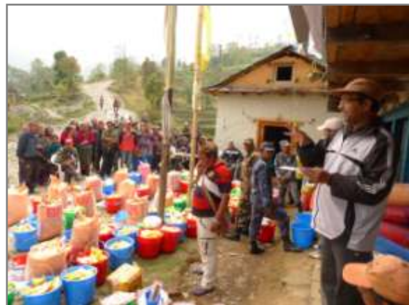
SAHAS Project Coordinator briefing the distribution of relief materials and affected households