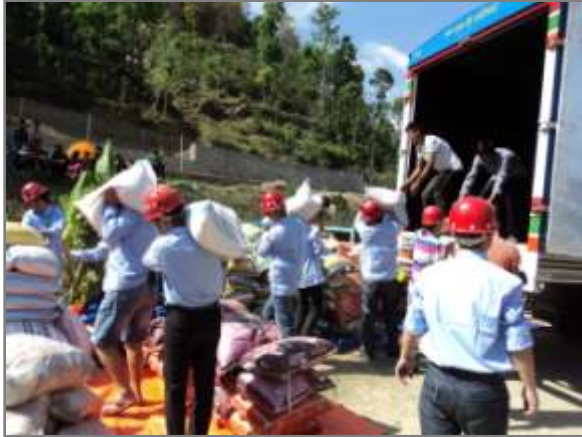
Chinese people helping unloading the relief materials provided by SAHAS in Rasuwa