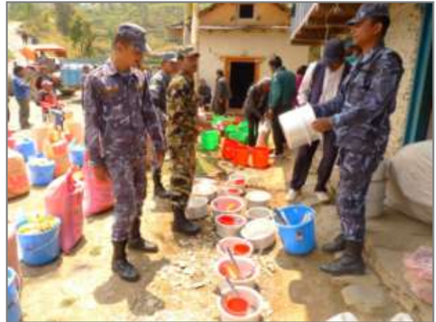
Nepal army and police helping in arranging the relief distribution