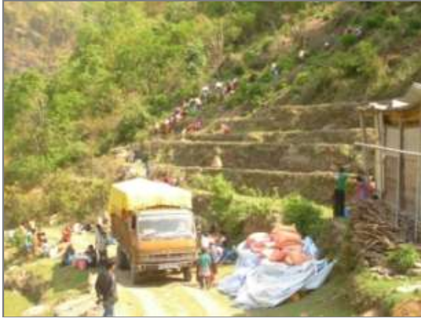
Affected families taking their relief materials