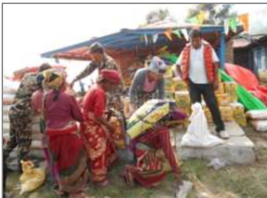
Woman carrying supported relief food items in Dhading district