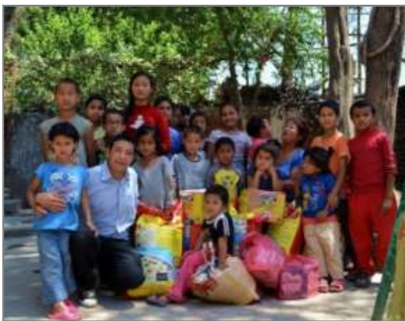
SAHAS staff providing relief materials to Surya Children Welfare Service Center Nepal