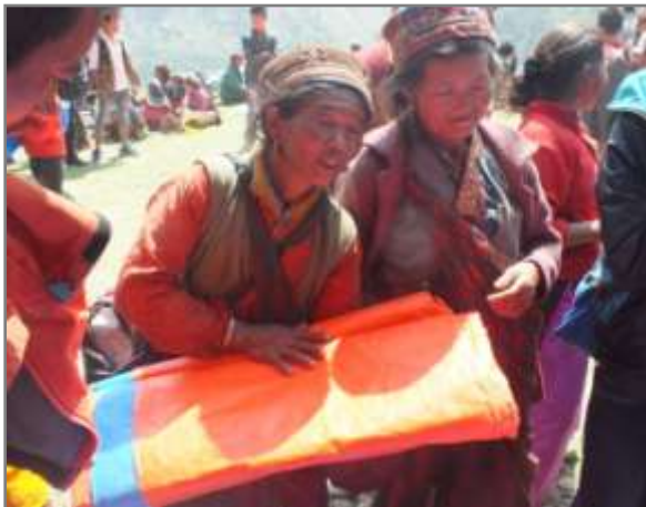
Rasuwa woman expressing their gratitude after receiving tarpaulins

With aim to provide immediate shelter to the affected families, a total of 7555 tarpaulins, 1770 pieces of blankets, 2982 and 450 pieces of mattress and mosquito nets respectively were distributed in 9 affected districts. Besides shelter, 300 sets of kitchen utensils (pans, pots, plates, spatulas, ladles, buckets and jugs) were also distributed in Okhaldhunga district.