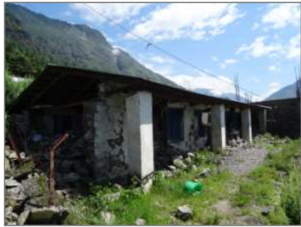
Completely damaged school in Dandagau, Rasuwa