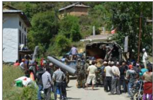
Distribution of relief materials to affected families in Lalitpur