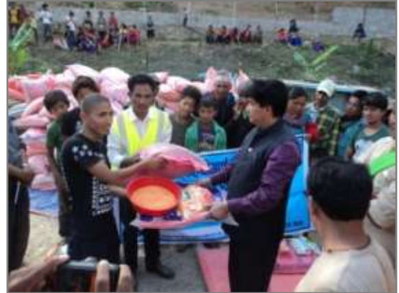
Rasuwa CA member participating in distribution of relief materials