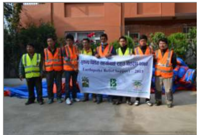
Volunteers of Rasuwa ready to bring relief materials in Rasuwa