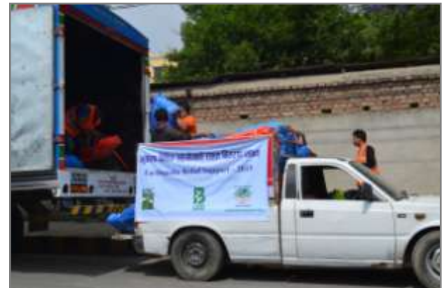
Loading relief materials to dispatch in the field