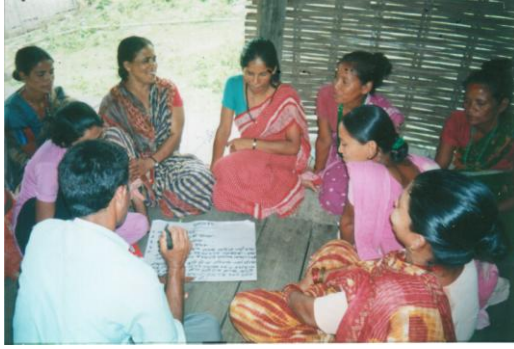
Focus group members designing their action-plan