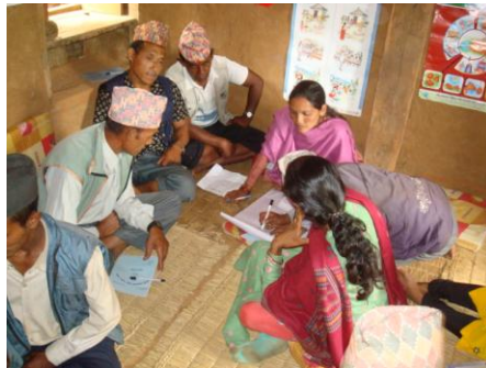
Small group discussion during the training

only through the efforts of SAHAS-Nepal but also by developing a common understanding among the main committees. Similarly, with the view of reaching the development opportunities to very poor and excluded communities (women, Dalit and Janjatis) in an equitable and democratic manner, the criteria of selecting development projects have also been prepared. The main committees will be certainly able gain a momentum if the criteria that have been developed collectively are adopted and implemented.