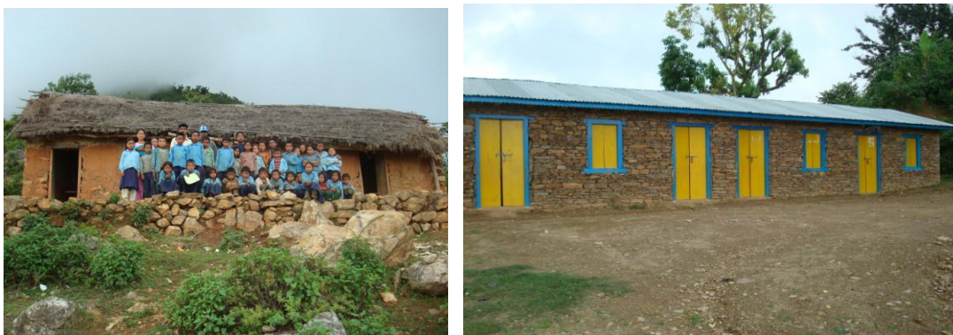
School building before (left) and after (right) the programme

development activities have helped to develop 'we' feeling among the communities.