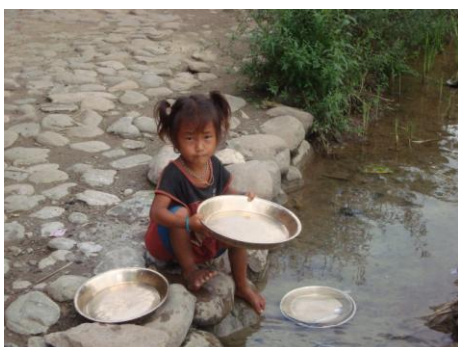
Washing dishes with dirty water (before programme)