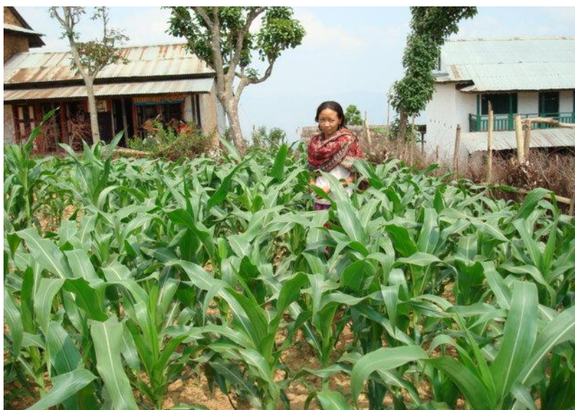
A women farmer observing the trail plot