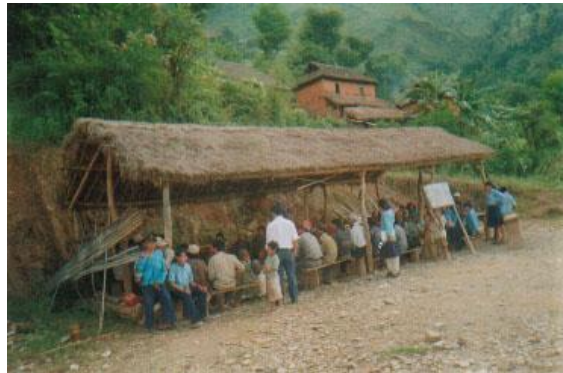
Child literacy class

With these activities they have come to set an example for other women in the community.