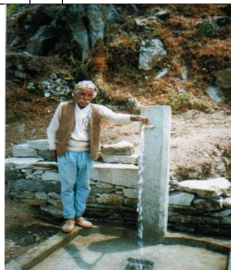
A water tap-stand right in the village brings happiness to the communities (after programme)