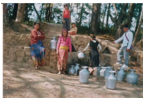
Women in long queue to collect water (before programme)