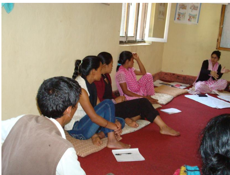
A project staff and volunteers discussing about the bio-fuel

A 2-day orientation workshop was organised for the farmers to be involved in the alternative energy programme to be implemented in 7 VDCs of Okhaldhunga district. The objective of the workshop was to impart knowledge and information on how the Jatropha trees could be managed in the waste land in their localities and about the advantaged that could be obtained in future from its use. The participants seemed to be very excited as how could they take advantage from the cultivation of Jatropha trees to be planted in the waste lands and fence ridges.