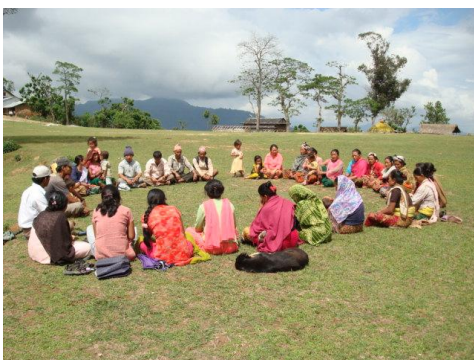
Participatory situation analysis by the focus group

With the objectives of providing information about the nature of the SAHAS-Nepal programme and activities, identify the programme locality and selecting clusters ( Tols ), 36 Ward level conventions were organised in 4 VDCs. The participants of these gatherings were very curious to know about the nature of programme, its modality of implementation and the duration of the programme. Hence they raised various pertinent questions about the programme. This gathering also identified four clusters of the VDCs besides identifying the focus group and selecting the contact persons to help in the cluster survey.