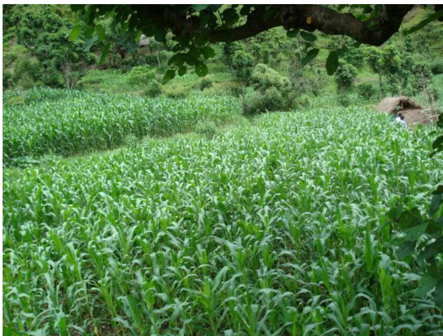
A standing maize crop trial