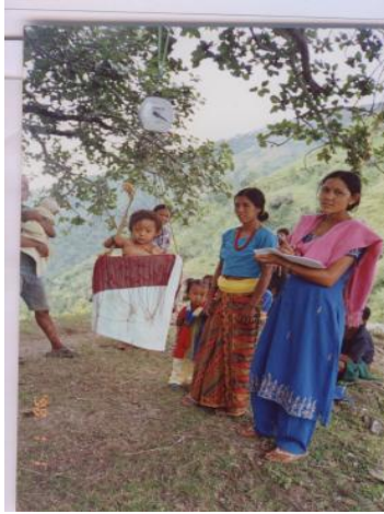
A child being weighed to examine the nutritional status

status of the children. Moreover, such activities also helped remove the parents' anxieties of suffering their children from malnutrition and other health problems, besides ensuring the children's rights to live.