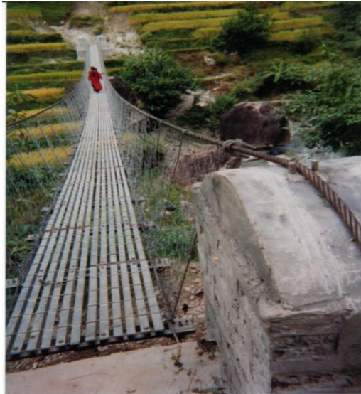
A suspension bridge constructed by the programme

able to comfortably perform the agricultural task in the farms across the river. This has also eased the tension of the school-going children and their parents, as they do not have to face these problems. The suspension bridge construction programme also provided employment opportunity though for a short period, consequently helping, to some extent, in sustaining their lives and livelihoods.