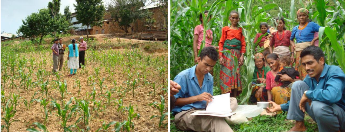
Participatory monitoring by scientists (left) and farmers and project staff (right)