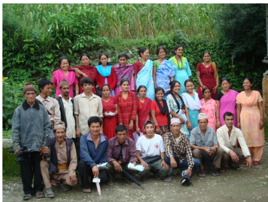
Participants of home gardening training

organising agriculture exhibition in order to take their agricultural products right up to the communities.