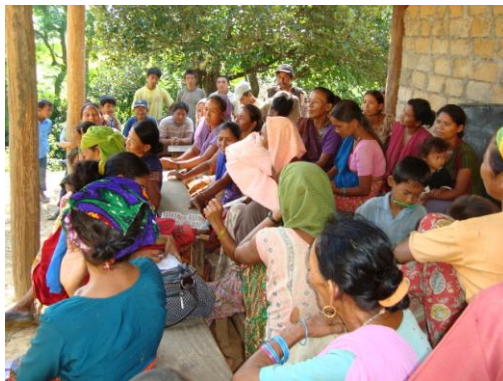
Women participation in the VDC level orientation meeting

A VDC level 1-day orientation programme has been accomplished in each of Risku and Katari VDCs. The purpose of the orientation activity was to clarify the programme objectives and implementation modality, besides establishing and extending the organisations' relationships with various local level governmental and non-governmental organisations. The programme was participated by the representatives from various offices and major political parties, teachers, women and Dalit leaders. Of 25 participants in the programme in Risku VDC, 10 participants were women, and of 32 participants in Katari VDC program 18 were women. These orientation programmes also prepared the action-plan for the Ward level convention.