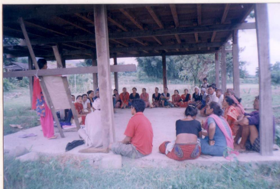
An orientation session for voters of Constituent Assembly election