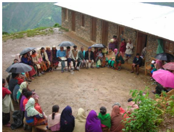
Participatory mid-term evaluation of the programme

In the beginning, the tool for monitoring was prepared with the involvement of the concerned VDC personnel, and the information was collected from 3 groups, i.e., the active, medium and less active groups with the representation of female, janajati and other persons (mixed) being selected from each VDC. The recommendations (suggestions) received from the mid-term evaluation are being adopted for the effective implementation and sustainability of the programme activities of the second phase. The detailed description of the mid-term evaluation is available in the mid-term report.