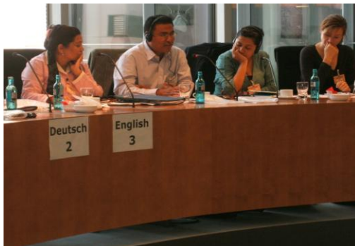
Chair of SAHAS-Nepal presenting paper in Germany Parliament