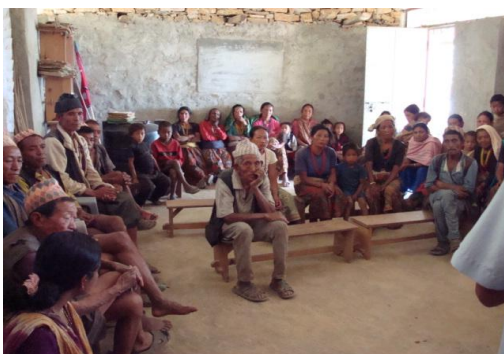
Participants of VDC level orientation workshop