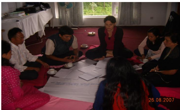
SAHAS-Nepal family including the adviser in Annual Review Workshop

In accordance with its strategic plan SAHAS-Nepal has been reviewing and documenting its past activities and written documents regularly in view of the future programmes and projects to be undertaken. The organisation has published a booklet on SAHAS-Nepal's ten years of journey in the development front. The organisation has also reviewed and developed its policies related to human resource and gender. In the process of publication and documentation, the organisation has been regularly publishing its annual reports, and has brought out various publications related to its development, research and advocacy activities. The documentation of such publications has contributed to advancement of the organisation's regular activities