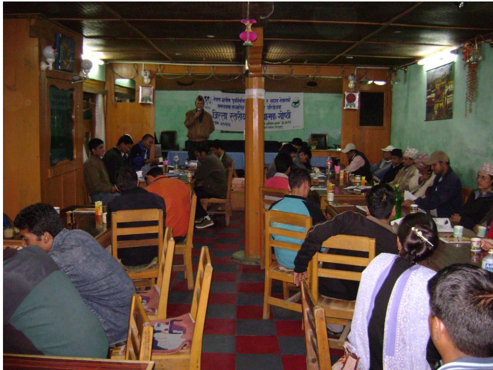
Constituent Assembly election candidates expressing their commitments

The convention was concluded with the participation of the representatives of the local communities, representatives of various political parties, the candidates of the Constituent Assembly election, representatives of the civil society, human rights defenders, press/media, security sector personnel and the representatives of international non-governmental organisations and the employees of the project.